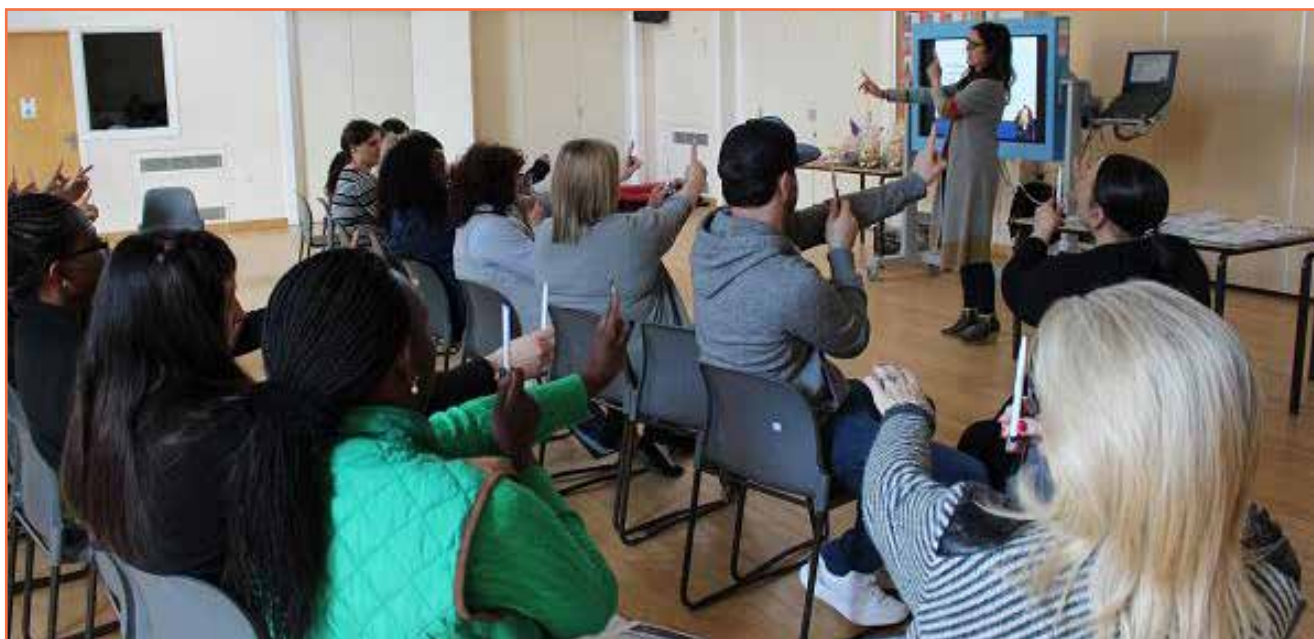
SeeAbility providing teacher training on eyes and vision at Moorcroft School

In 2019 we were also awarded funding from The National Lottery Community Fund for employing 7 people with lived or work experience of learning disability, autism and sight loss to make people with learning disabilities, supporters and professionals in London and the North West eye care aware. The Every Day in Focus project will support the roll out of the service in special schools in those areas.